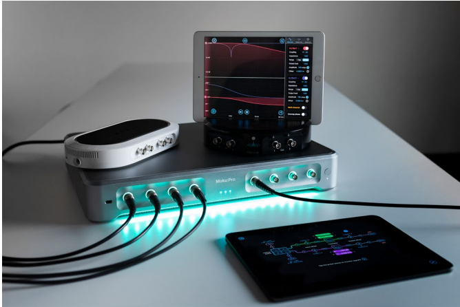
Figure 1. Liquid Instruments' Moku family gives researchers multiple scientific instruments in a single platform

Website: https://www.liquidinstruments.com/