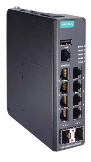
Figure 1. Moxa TSN-G5000-Series Ethernet Switch