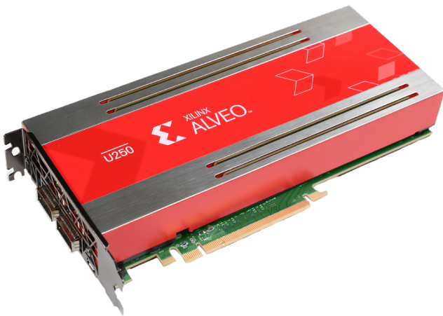
Figure 2. Alveo U250